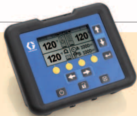
Remote Display Kit 24K338 The convenience of having your controls at the spray site. With a Remote Display, your sprayer/operator can: