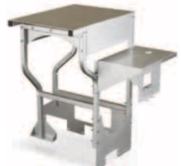
Compressor Rack Kit (frame only) 24M258 Designed for Champion BR-5 or Quincy PLT5-5B Compressors. (Some assembly required).