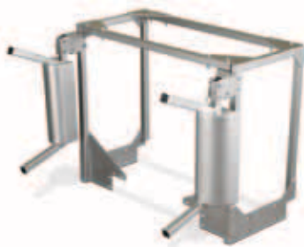
Hose Rack Kit 24K336 Supports 310 feet (94 m) of heated hose. (Some assembly required).