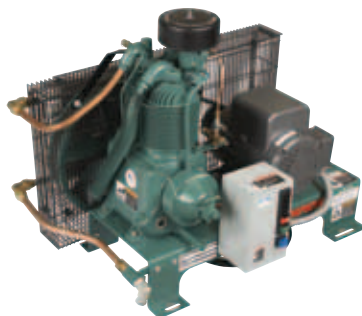
Air Compressor (without tank) 125970 Champion BR-5 base mount, 5 HP, 240V, 1-ph, 60 HZ, belt guard aftercooler, pilot valve unloader.