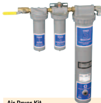
Air Dryer Kit 24M178 Three-stage air dryer: air filter, coalescer and desiccant housing.