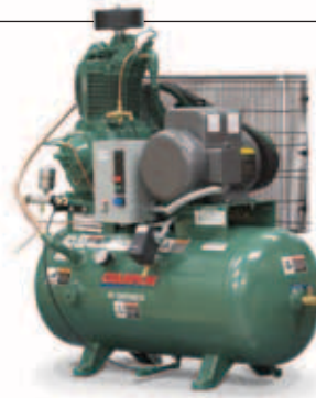
Air Compressor with Tank 24M490 Champion HR5-3, 5 HP, 240V, 1-ph, 60 HZ, 30-gal, pilot valve unloader, auto tank drain.