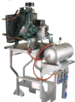
Complete Air Compressor Kit 24K335 Includes rack, compressor, tank and air dryer. (Some assembly required).